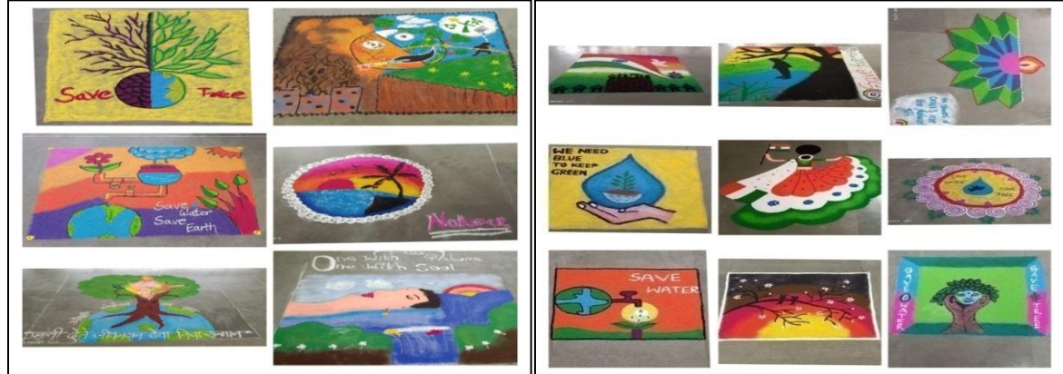
RANGOLI COMPETITION WHERE STUDENTS SHOWCASE THEIR SKILL OF CREATIVITY