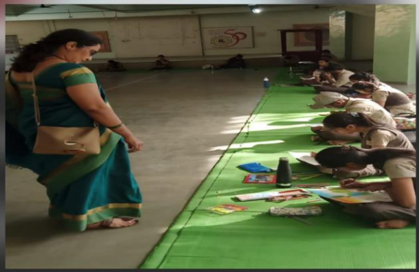
STUDENTS SPREADING COLOURS OF JOY ON CANVAS ,DRAWING COMPETITION