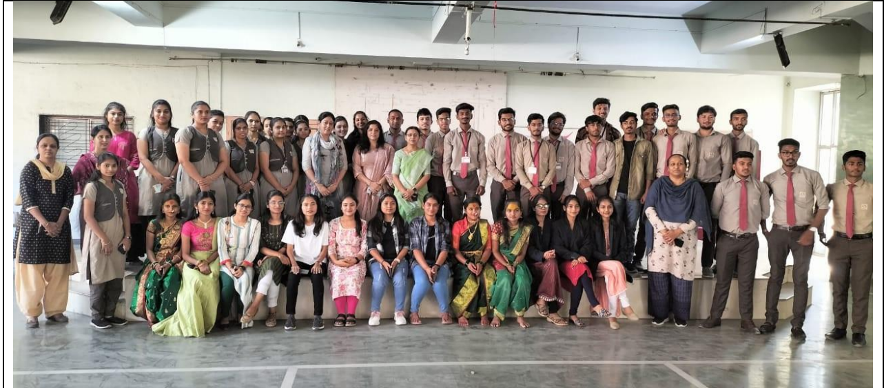
EXPRESSION OF LIFE WITH DANCING ,DANCING COMPETETION