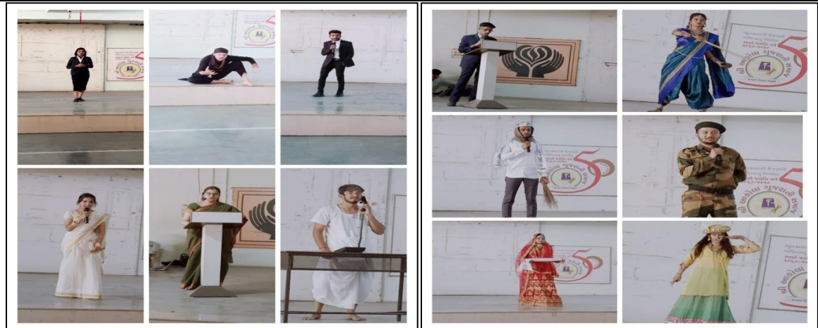
FANCY DRESS COMPETITION WHERE STUDENTS PERFORM THE ROLES OF VARIOUS EMINENT PERSONALITIES AMONG ALL THE FATERINITIES