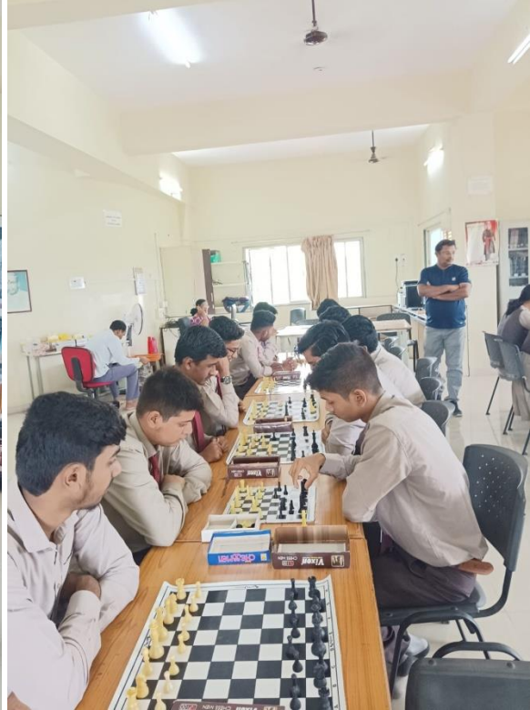
A BRAIN TONIC ,CHESS COMPETETION