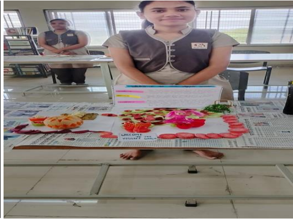
STUDENTS PRESENTING THEIR CREATIVE SALAD DISHES WITH EXPLAINING THEIR NUTRITIONAL VALUES